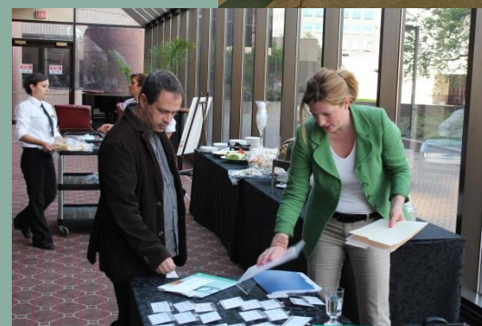
Advocacy Day, 2011