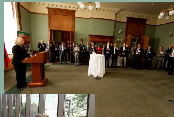
Advocacy Day, 2011