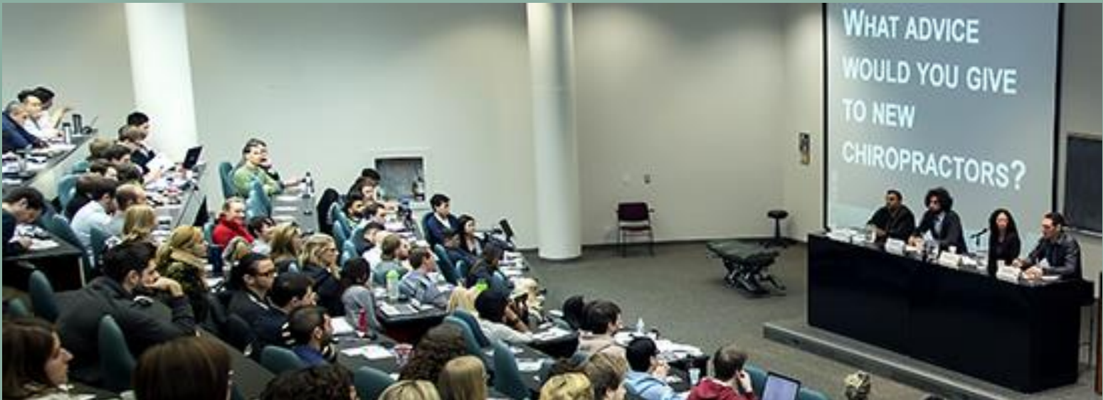
OCA Practice Realities Panel at CMCC Practice Opportunity 2014

Increase chiropractic credibility through speaking engagements